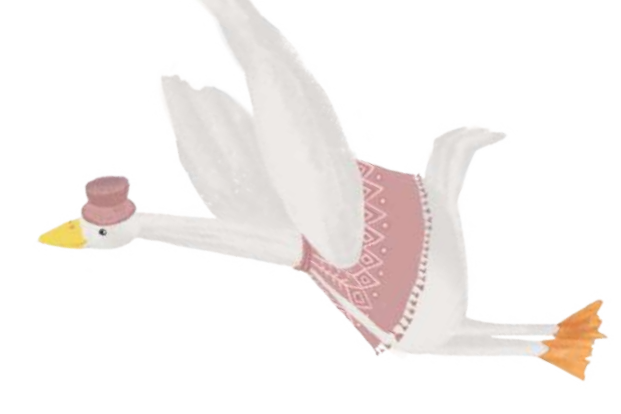
A Goose in flight?