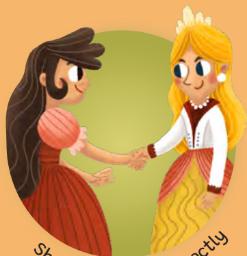
Shaking hands correctly