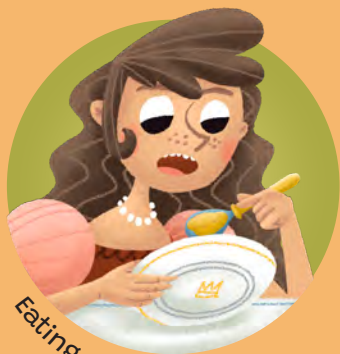
Eating soup correctly