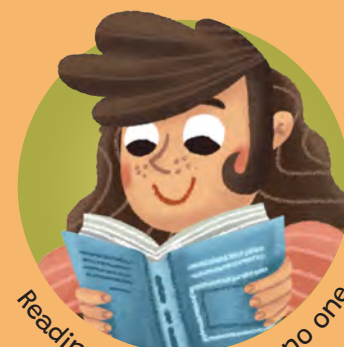
Reading quietly annoy no one