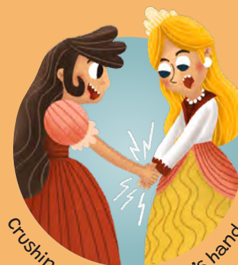
Crushing another person's hand