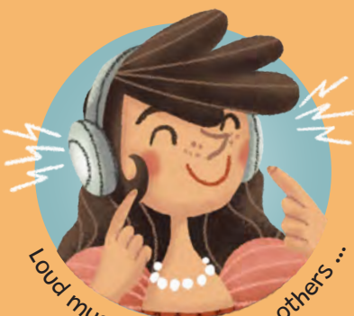
Loud music might annoy others ...

You need more than a few magical mice to turn the grubby Cinderella into a beautiful, well-mannered princess. What you need is a couple of lessons in royal etiquette. Fortunately, Cinderella is quick to learn and willing to stop spitting cherry pits if it pleases her prince. Join her in learning how to take care of yourself, who greets whom first, how to eat spaghetti, and what all those spoons, forks, and many other things are for. A cute little dragon will assist you gladly. And who knows, perhaps he and his mistress, the strict queen, will in turn learn something important from the playful Cinderella ... Wait and see!