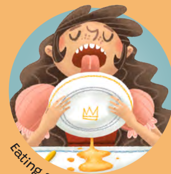
Eating soup like a dog