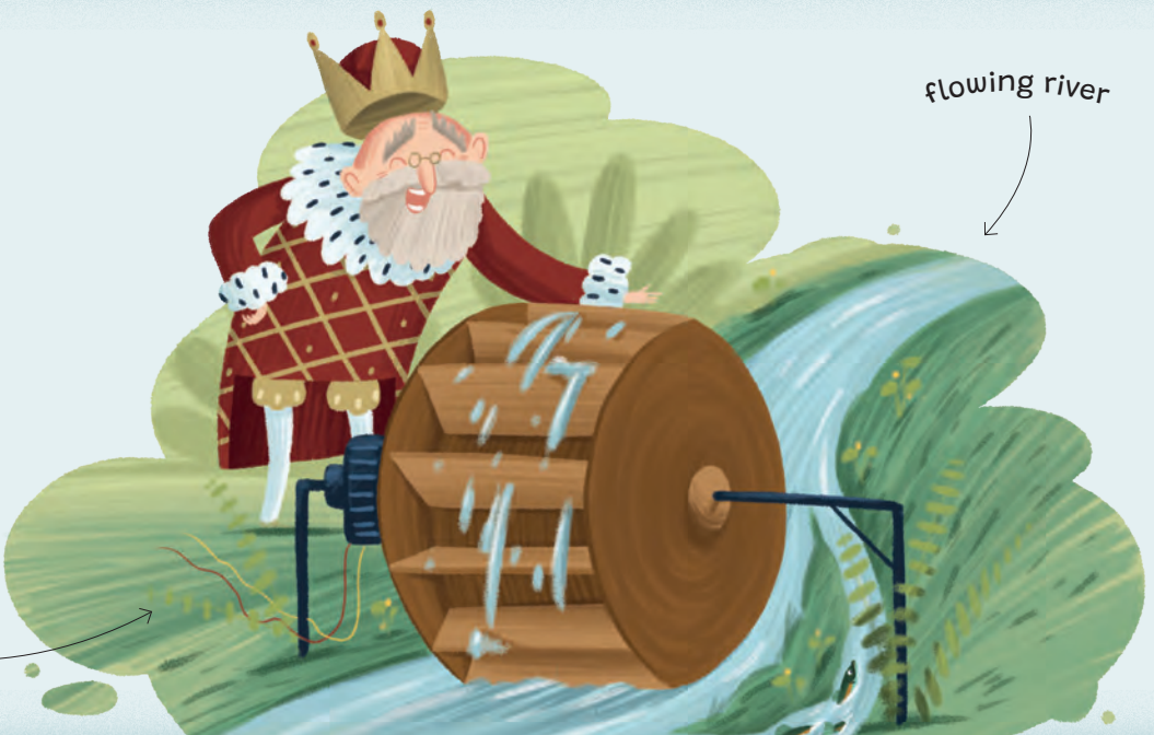
small hydroelectric power plant

Small hydroelectric power plants are similarly safe and environment-friendly. They use the power of water.