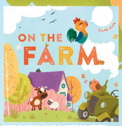
AND WHO WILL YOU MEET ON THE FARM?

Countless animals live in the wood. Some you can meet in broad daylight, others you see in daytime only rarely. By pressing the magic buttons in this book, you will hear real animal voices. What better way to learn that a wood never sleeps?