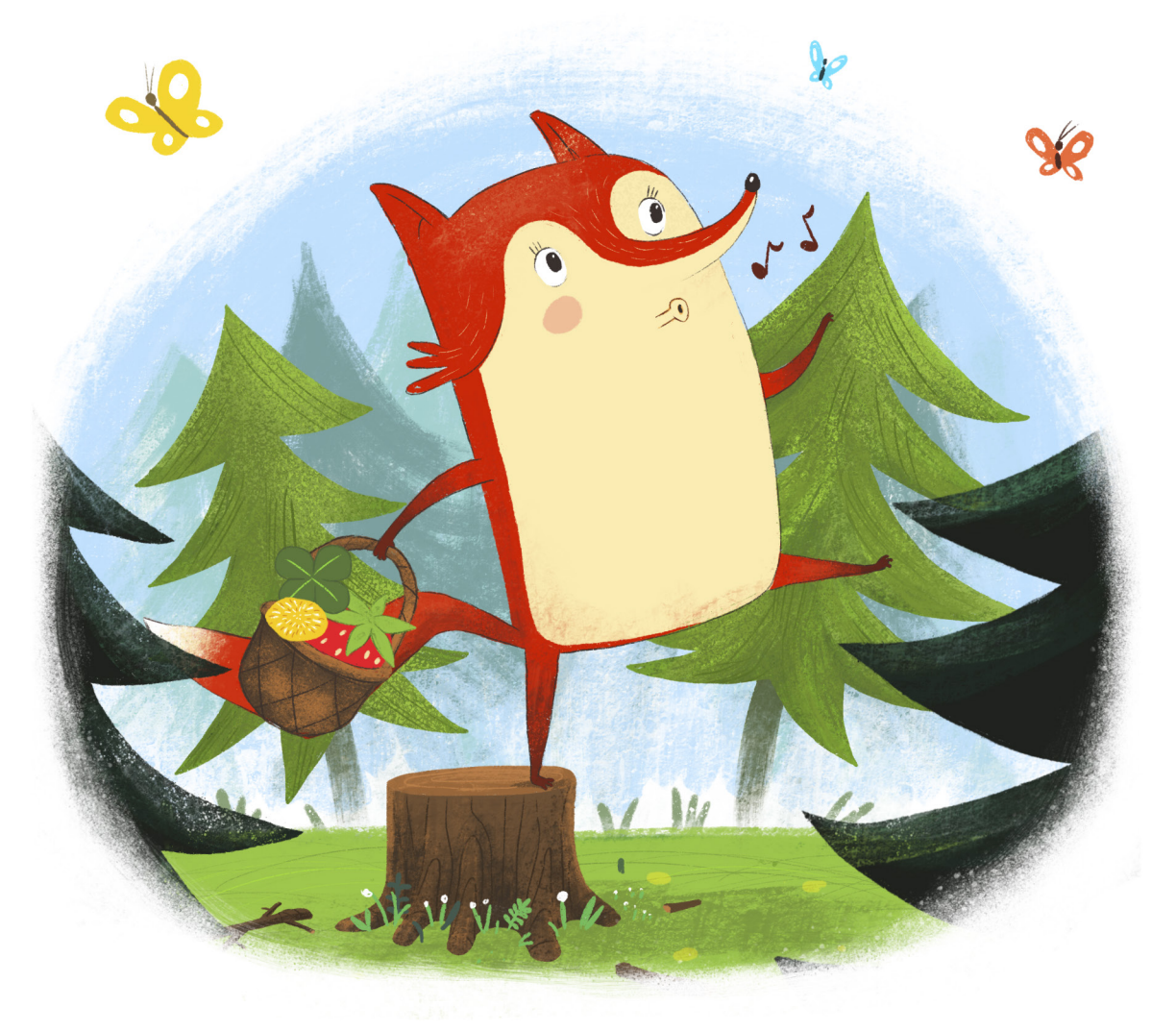
Franny Fox is looking for bilberries in the forest. In her basket she has a red strawberry, a yellow dandelion and a green four-leaf clover. But what's that under the conifer?