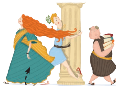
SIMONETTA A beauty from Florence

In Roman mythology, Venus was the goddess of love, made of the fine foam of the sea. In the painting, she is standing in a scallop shell, and the two figures blowing on her are wind gods called Zephyrs, who by their breath are trying to carry her to the shore, where Thallo, the goddess of spring, is waiting for her, holding out an ornate cloak. The roses in the picture have been born along with Venus. Can you see them, all around her?