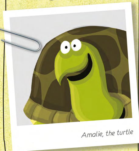
Amalie, the turtle