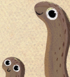
Moray eel ►