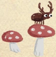
Stag beetle ►