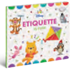
Etiquette is Fun!