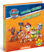
Learning Colours with Paw Patrol