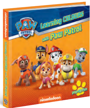
POP-UP FUN Learning Colours with Paw Patrol

Size 190x190 mm, 6 spreads with pop-ups, hardbinding