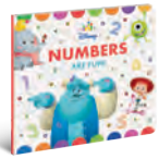
Numbers are Fun!