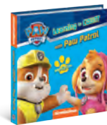
Learning to Count with Paw Patrol