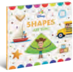
Shapes are Fun!