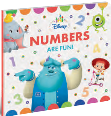
FLIP-AND-POP Numbers are Fun!

There are so many important things kids need to learn. Numbers, colours, shapes... even basic social expressions! With the help of kid's favourite Disney characters and unique playful format children will learn everything in no time. As they browse through the pages, a pull bar sticks out of the page. This way, they practise everything they've learned!