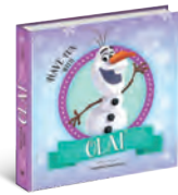
Have Fun with Olaf!