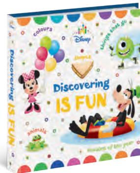
POP-UP FUN Discovering is Fun