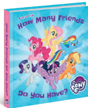
POP-UP FUN My Little Pony: How Many Friends Do You Have?