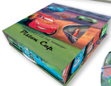
PEEK INSIDE A FAIRY TALE Race for the Piston Cup