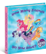
My Little Pony: How Many Friends Do You Have?