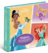
Magical Moments with Princesses