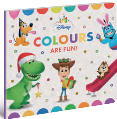
FLIP-AND-POP Colors are Fun!