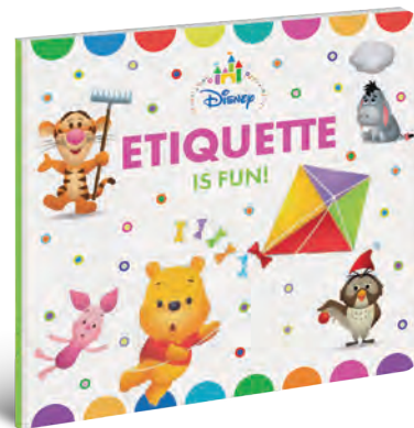
FLIP-AND-POP Etiquette is Fun!