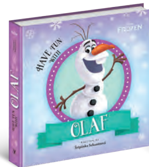
MAGICAL DISCOVERING Have Fun with Olaf!