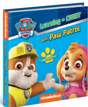
POP-UP FUN Learning to Count with Paw Patrol

Wouldn't it be great if children learned the essentials and had fun at the same time? With this series, they will do so! On each spread, their favourite Paw Patrol character is waiting for them to help them learn basic colours, numbers and much more. Moreover, the main characters are in a form of a pop-up. Puptastic!