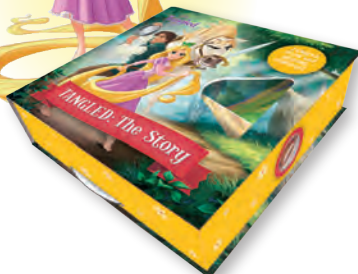
PEEK INSIDE A FAIRY TALE Tangled: The Story