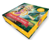
Tangled: The Story