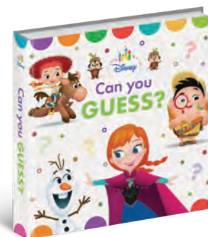
MAGICAL DISCOVERING Can You Guess?