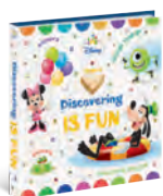
Discovering is Fun