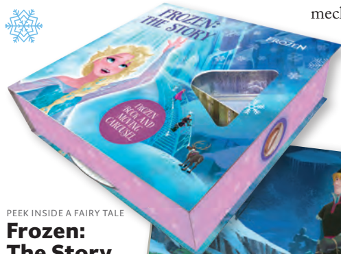
PEEK INSIDE A FAIRY TALE Frozen: The Story

A panoramic TV carousel filled with your favourite Disney fairy tales and surprises. The classic Disney stories for the very young in truly non-traditional form. Twice the same fairy tale, in two different versions. A book for parents and children whose design is sure to captivate children so that they will return to it again and again. The set contains a twenty-four-page full-colour illustrated book that tells the story of Frozen, Tangled and Cars' Race for the Piston Cup in simple wording. The most interesting thing is hidden in the box with the peephole, where the child can find a three-dimensional panorama. The child and parent can move – using a turning mechanism – from one of eight delightfully illustrated 3D scenes to the next. The book can be removed from the set so that the child can view the story through the magnifying peephole while the parent reads the story.