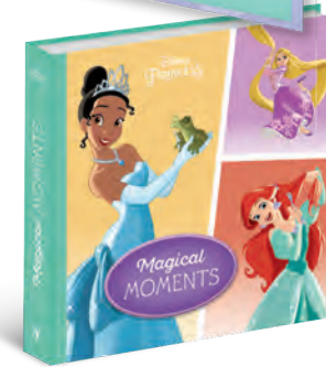
MAGICAL DISCOVERING Magical Moments with Princesses