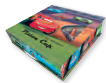
Race for the Piston Cup