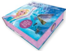
Frozen: The Story