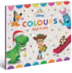
Colors are Fun!