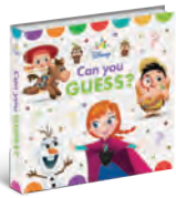
Can You Guess?